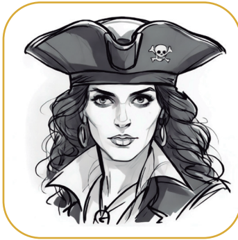
CAPTAIN ISABELLA "Tiger Eye"

Bold and cunning, Captain Isabella stands out for her unmatched skill in battle and the keen perception that earned her the nickname "Tiger Eye." Rumors suggest she is the unacknowledged daughter of Captain Black, though no one has confirmed it. Isabella is a fierce leader, able to guide her crew with bravery, always in pursuit of victory — yet her fighting spirit hides a more personal quest.