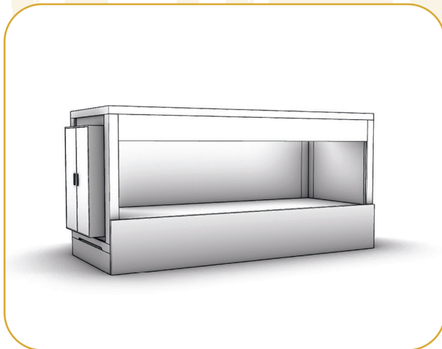
The Experience | Basic module

Large containers designed exclusively for ample exhibition spaces that have wide doors and sufficient logistical capacity.